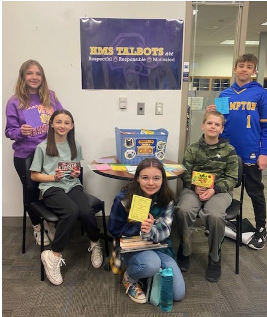
Student PBIS Winners on Wednesday, April 5th