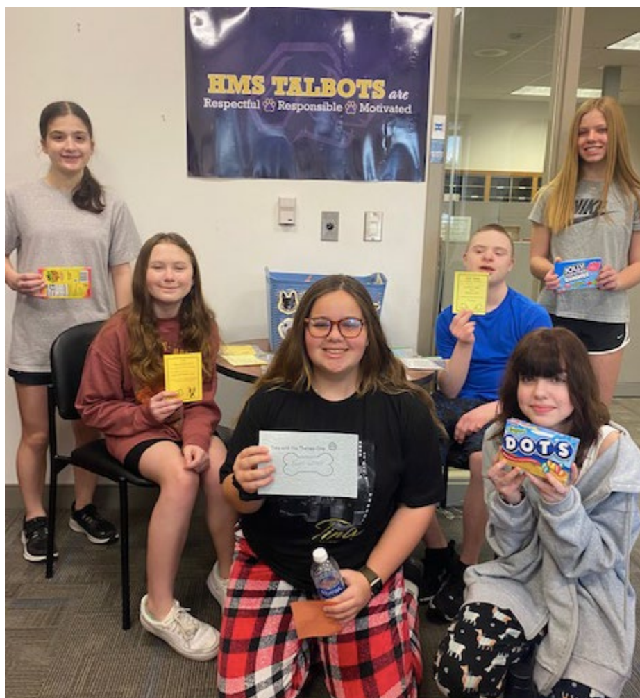
Student PBIS Winners on Friday, April 14th